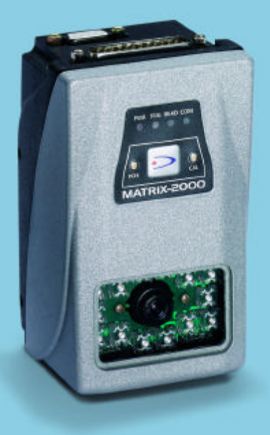
Unattended Scanning Systems