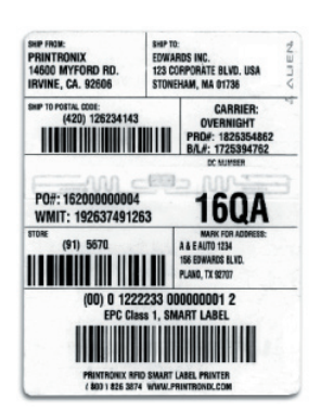
Figure 2 – Typical format for case labeling.

Application requirement – Tag readability is a major factor. A complete product packaging study (also called a case analysis) is required to ensure tag readability. Case analysis should include a comprehensive assessment of package contents, packaging design, label placement and the package labeling process. Package contents and packaging design may affect tag readability, particularly if metals, liquids, high carbon or salt content is involved. This affects label placement on the package, and package orientation with respect to readers as it moves through the process. Storage and handling requirements determine whether you need such things as freezer-grade adhesive, or polyester rather than paper label material to withstand heat.