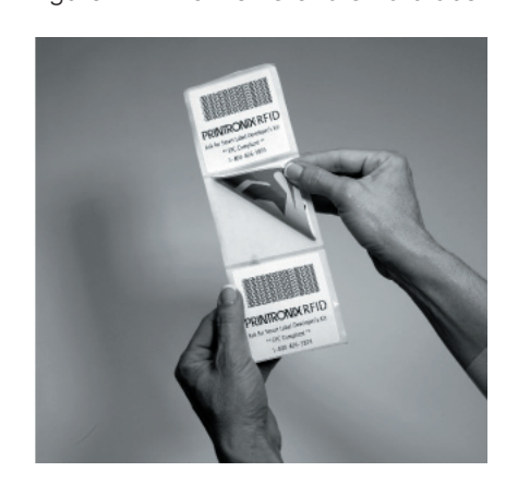
Figure 1 – Two views of a smart label.

Labels are printed using a thermal print process. A print head, embedded with a matrix of tiny heat elements that are precisely controlled, uses heat to transfer a wax or resin ink to the label. The ink is on a separate ribbon inside the printer. Smart labels come in rolls of various sizes which, along with the ribbon roll, are mounted inside the printer/encoder. An alternative to the label/ribbon system is direct thermal media, whereby chemicals in the label turn black when headed by the print head.