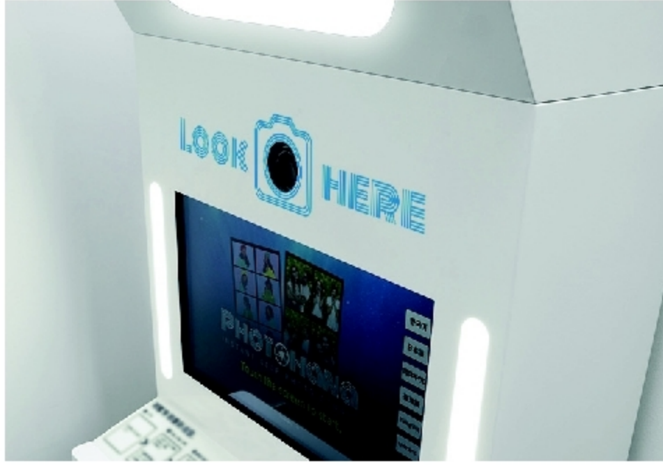
Flash Strobe for Brighter Shooting