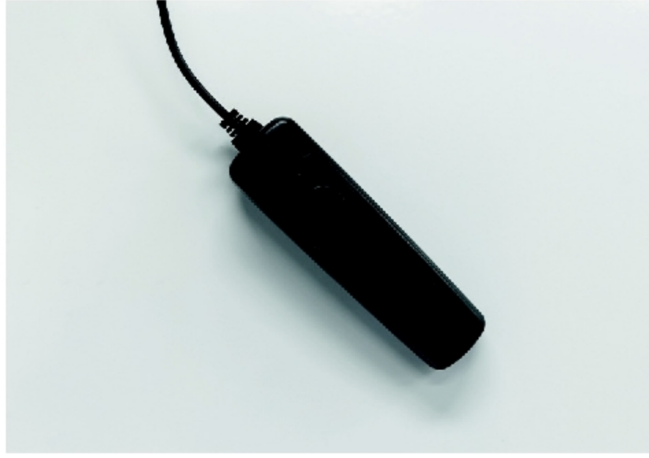
Convenient Shooting with Remote Control