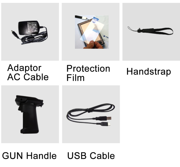
Adaptor AC Cable